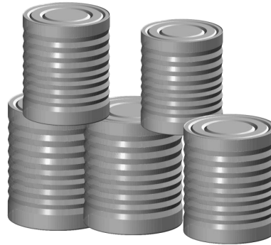
Tin Can Alley